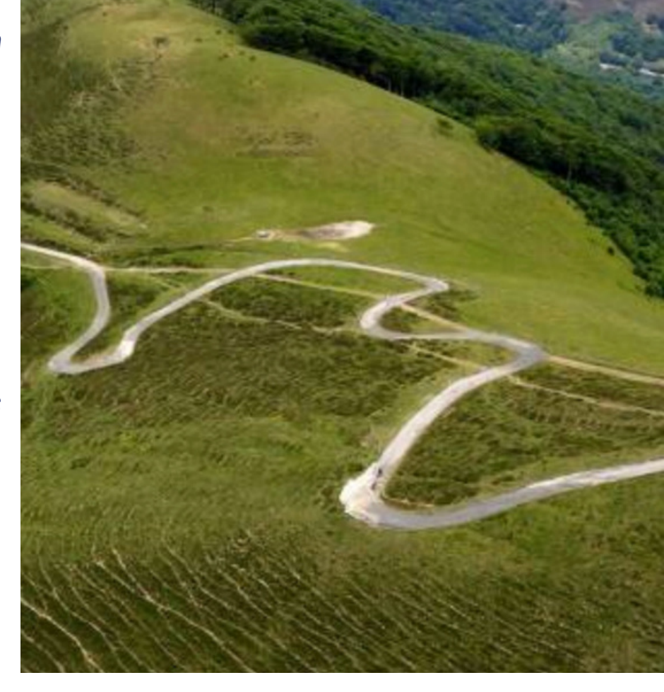
Read the article at www.lasalle.org

The process leading up to July 2027 will be transparent: all the key players in the Region will be involved in its implementation and regularly informed of the steps taken. We encourage everyone to embark resolutely on the actions and projects that will be launched shortly.